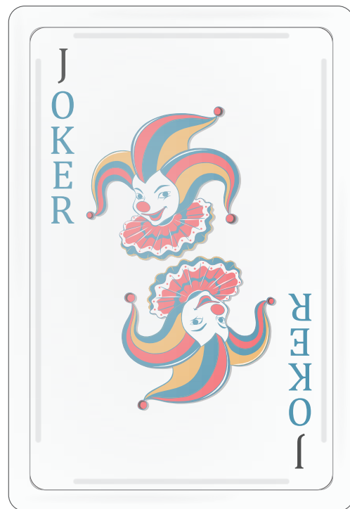
UNPRINTABLE CARD CASE

Blue Line = The SIGNIFICANT PRINT AREA (Keep all critical images & text within this box) Black Line = Maximum print area Pink Line = Bleed off to here